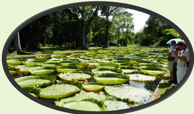
Pamplemousses Botanical Garden Mauritius

I had a tough couple of marriages, first one ended and after the divorce I moved to Australia. My second marriage also didn't work out, but I am very fortunate to say I have four beautiful children and six adorable grandchildren who I love very very much. They are all very healthy and smart.