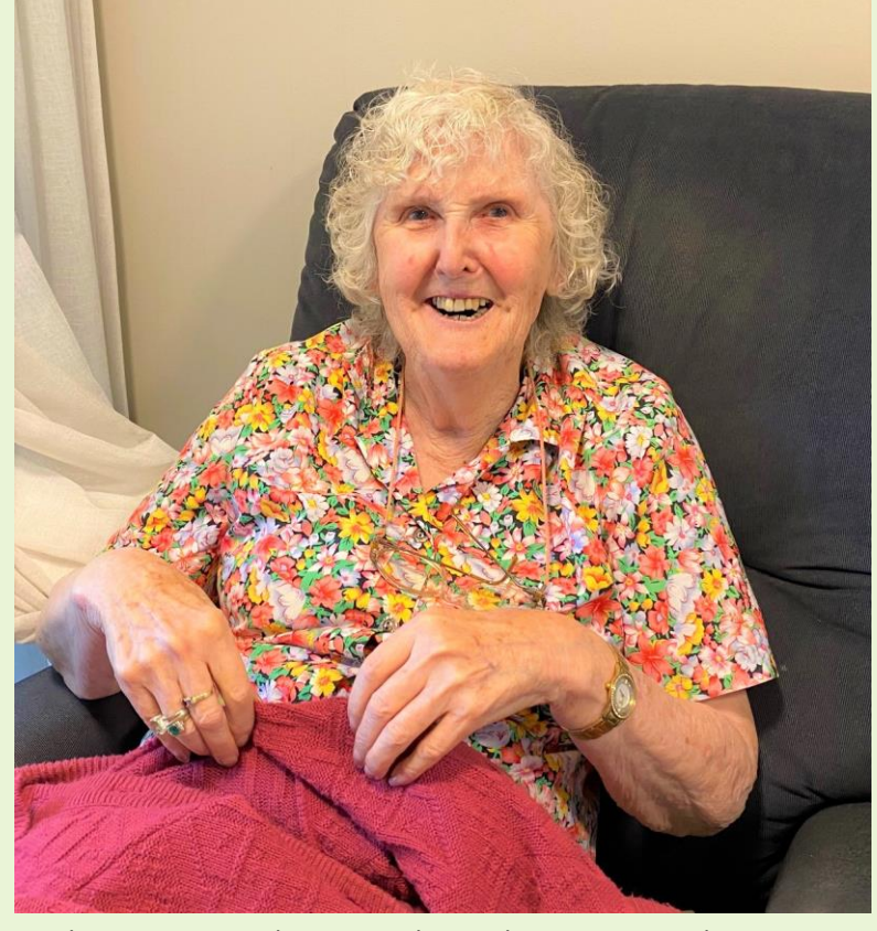
I then returned to Sydney living in Belmore until becoming a resident at Leigh Place.

Initially I worked at the Commonwealth Bank as a clerk in Bowral. Then I became a nurse to look after people and be of help to the community. I worked at the Royal Prince Alfred Hospital before moving to Adelaide for 12 years to work as a midwife along with other jobs.